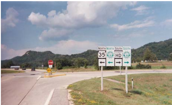
Intersections like this one at the STH 35 off ramp are considered dangerous by some local residents.

Action 1-2d: Work with the State, La Crosse County, and the LAPC to create on-road bicycle facilities (e.g. bike lanes and paved shoulders) in conjunction with roadway reconstruction and determine appropriate bicycle route signage.