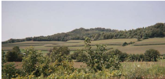
Active farmland in the Town of Holland.

Action 1-2d: Identify agricultural programming through local, regional, or state entities for education and/or funding resources available to sustain active agriculture.