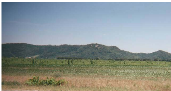
Amsterdam Prairie and local topography.

Action 3-1a: Work with La Crosse County and relevant agencies to continue to update the Environmental Features Map (Map 5.1) to show environmentally sensitive areas such as wetlands, lakes, rivers, streams, floodplains, woodlands, remnant prairies/grasslands, etc.