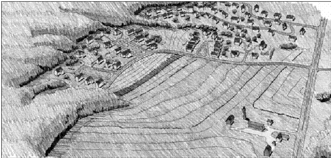
This Coulee Visions illustration shows how conservation residential development protects existing agricultural operations and woodlands.