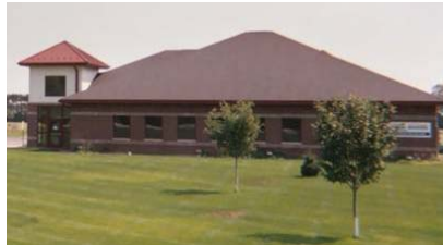
The Seven Bridges Bank facility was identified in the Photo Survey as a preferred business development.

Survey respondents were generally unreceptive to the further development of “Quarrying/Sand & Gravel pit operations” with over 63 percent rejecting this use.