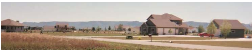
Existing residential lots in 1 and 2-acre configurations.

This residential category identifies areas in which existing and new neighborhoods should be located. This category recognizes newer residential development within the Town and designates some potential 1-acre (or smaller) lots adjacent to existing areas of residential concentration. Home occupations by conditional use permit will be considered on a case-by-case basis.